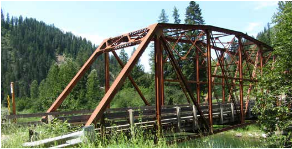
SNAPSHOT: Wallace to Avery Ride