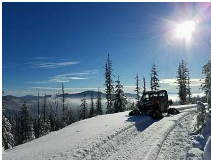
Cool winter day photo

Submitted to our Face book page in February.