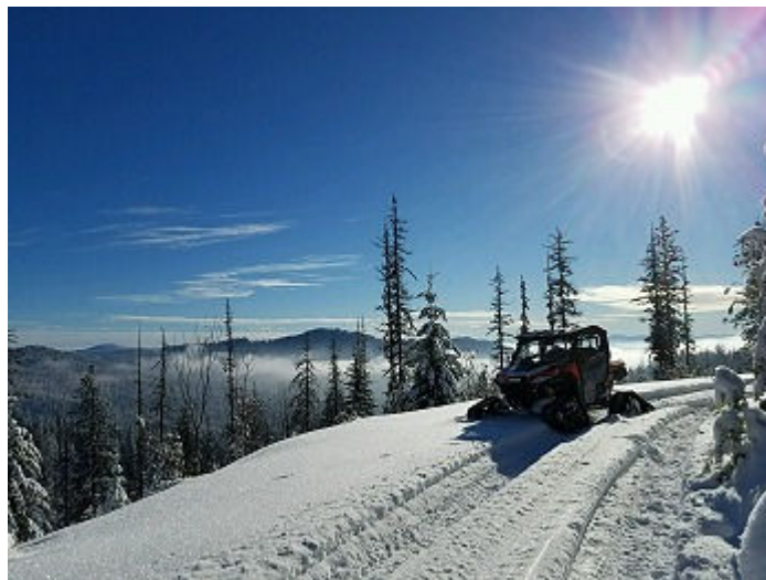
Cool winter day photo

Submitted to our Face book page in February.